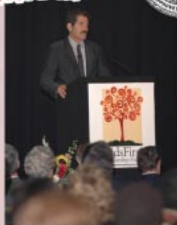
John Stossel, anchor of ABC's 20/20 program, addressed the KidsFirst Minneapolis Annual Dinner this September.