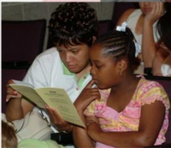
A CSFP student and her mother peruse the program for the Philly event.