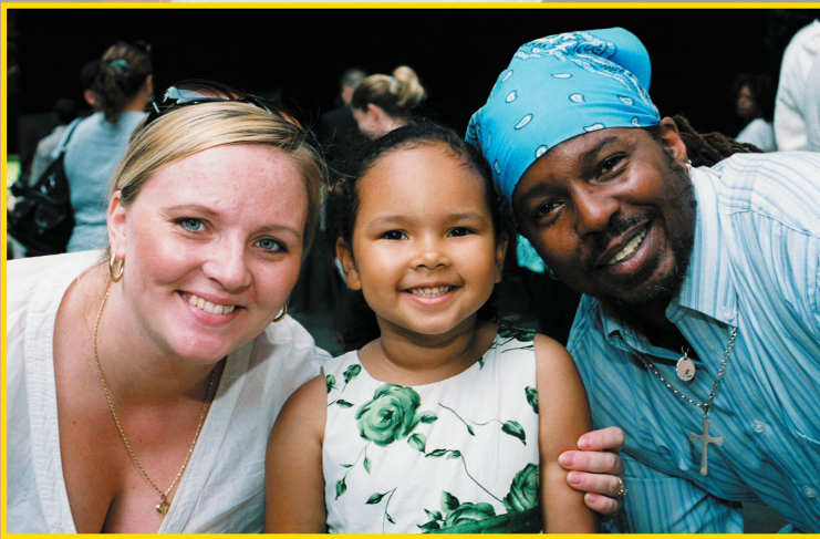
A CSF Philadelphia family enjoys the festivities at the recent Kimmel Center event. (See page 1 for the full story.)