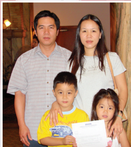
One of the newest CSF Philadelphia families shows off their awards at the June announcement ceremony.

Since its inception in 1998, CSF Philadelphia has provided more than 4,500 scholarships for local children to attend private schools.