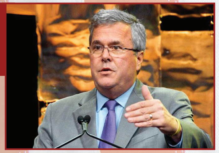
Former Florida Governor Jeb Bush headlined the ACE Scholarships luncheon this spring in Denver. More than 1,500 people attended the luncheon.