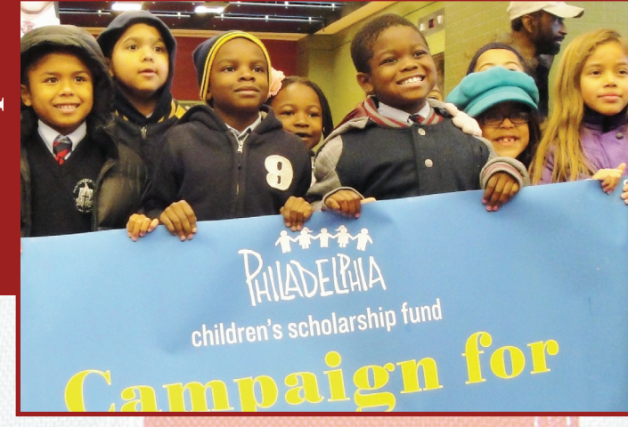
CSF Philadelphia Scholars were on hand to help spread the word at the Annual New Application Kick-off Event at Citizens Bank Park.