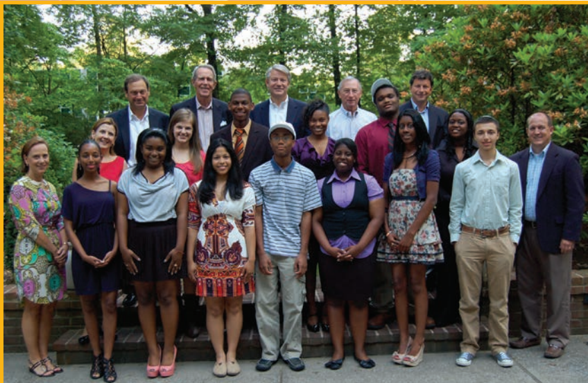
CSF partner program Memphis Opportunity Scholarship Trust (MOST) board members pictured with twelve graduating MOST scholarship recipients who were honored at a dinner this May. CSF partnered with MOST to provide more than 400 scholarships to Memphis students this year.