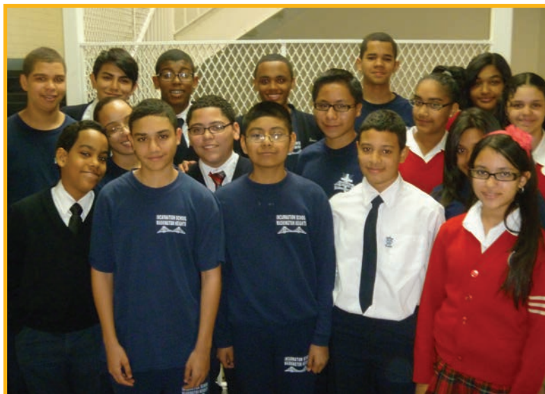
CSF Scholars from the 8th grade class at Incarnation School in Washington Heights are ready for high school!

As the 2011-2012 school year comes to an end, we are proud to congratulate more than 2,200 graduating 8th graders who are using CSF scholarships nationwide. On our school visits this spring, it has been especially heartwarming to hear the excitement in their voices as they talk about their plans for high school and college.