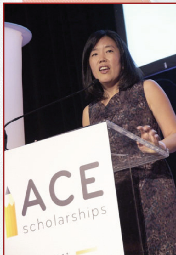
Michelle Rhee, Founder and CEO of StudentsFirst, addresses an audience of more than 1,000 at the annual ACE Scholarships luncheon in Denver. ACE Scholarships partners with CSF to fund more than 500 scholarships for Denver children.